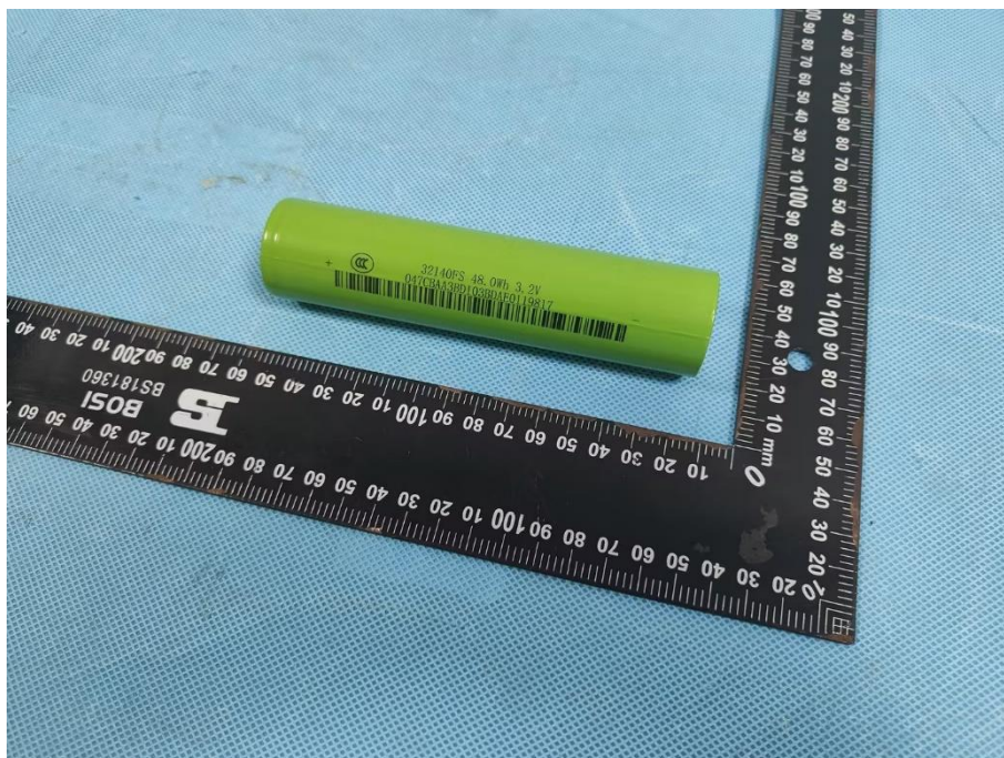
Photo 1 电池正面 Front view of Cell